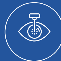
YAG Laser Treatment